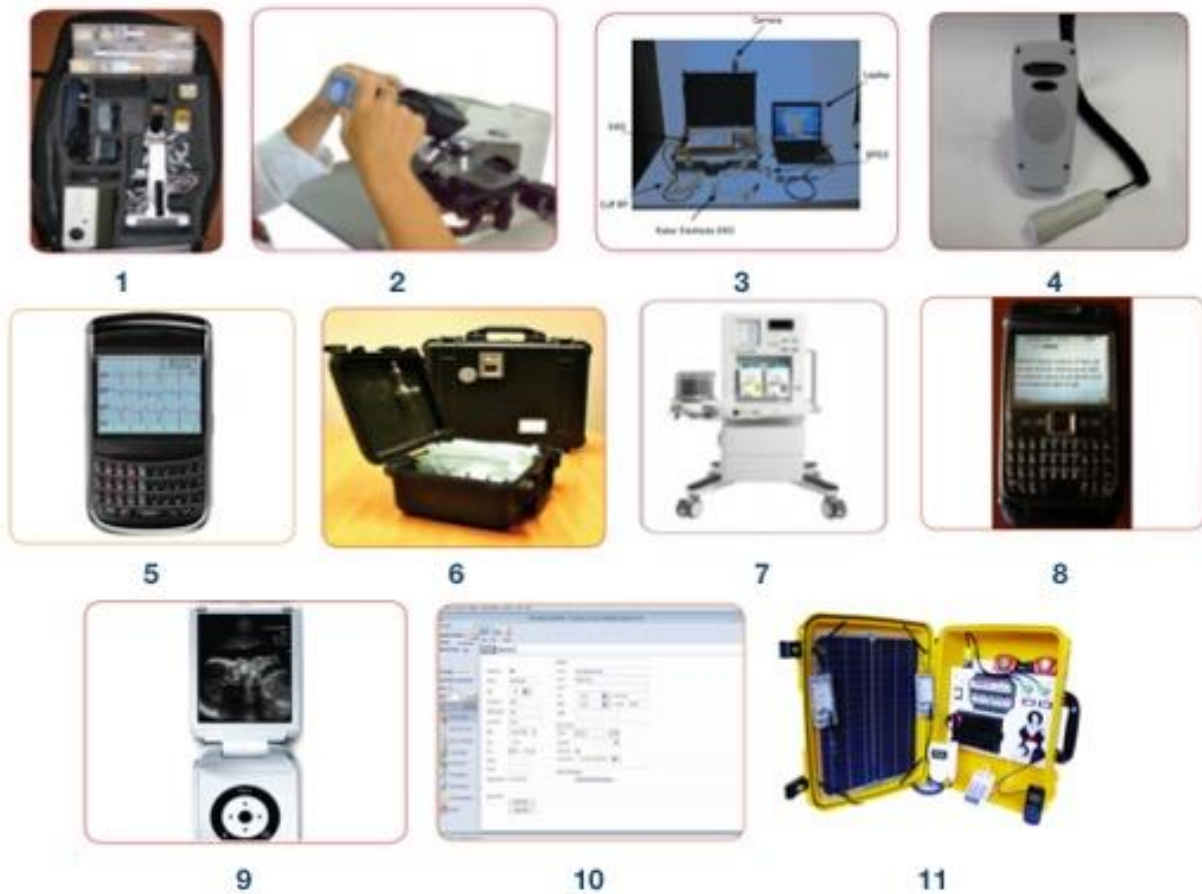
Figure 3. Photos of Promising Technologies