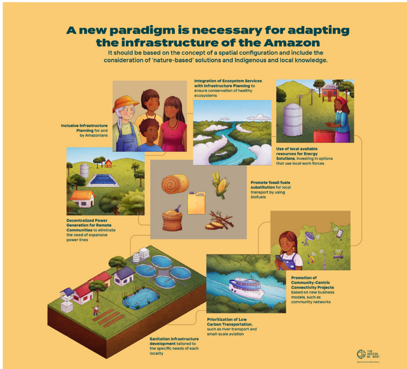
GRAPHICAL ABSTRACT: A new paradigm is necessary for adapting the infrastructure of the Amazon.

the transportation cost of commodities, Amazonian nations and territory have pursued coordinated infrastructure plans to construct multimodal transportation corridors that connect the Atlantic and Pacific Oceans, as well as the Amazonian region, with the rest of South America and the world 6,7 (Figure 1). These plans have included the construction of 147 hydropower projects (in addition to 160 already under construction or in operation) to expand electricity output in support of