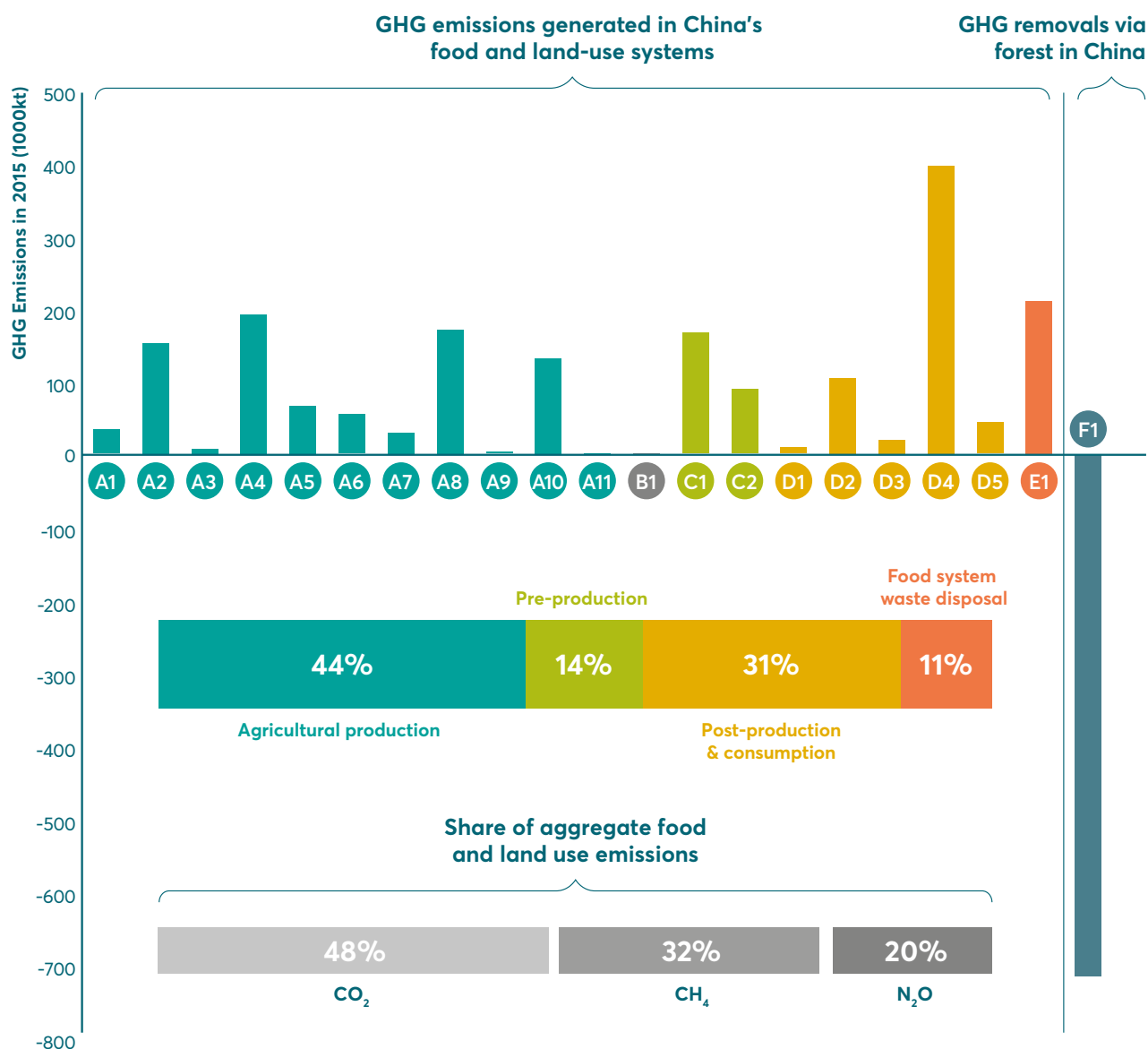
Figure 2. Estimated GHG emissions and removals by China's food and land use systems in 2015